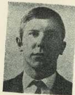
RONALD B. LARAMY REUTERS

Identity photos of foreign reporters killed in Cholon on May 6, 1968 by communist troops of North Vietnam.