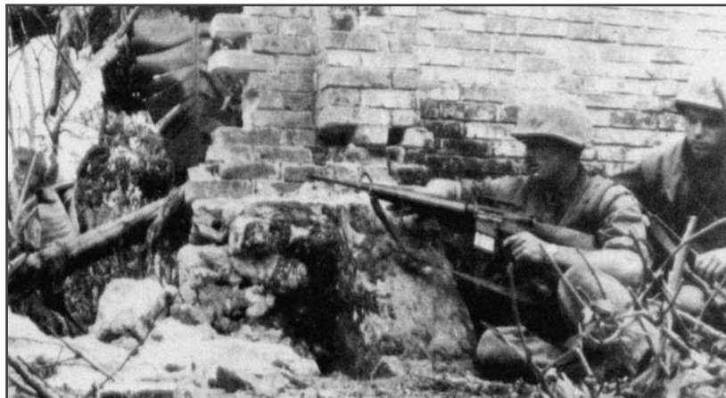
Co H, 2d Bn, 5th Marine troops take cover in heavy fighting in Hue City.