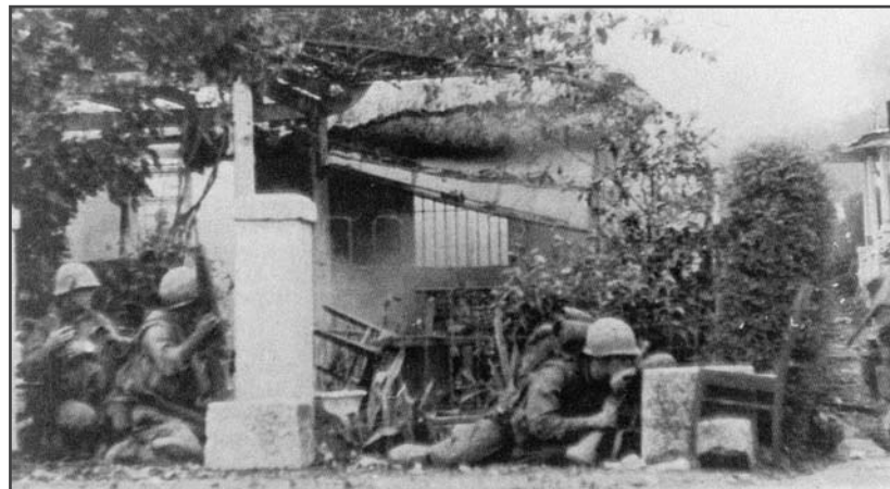
Co L, 3d Bn, 5th Marine troops use walls and houses to cover their advance in street fighting in the Citadel.